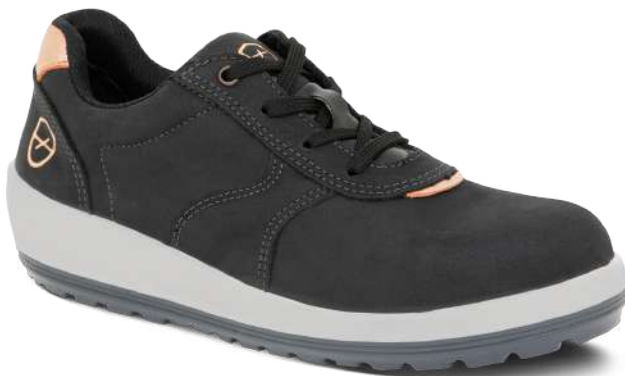
2735 CHARCOAL GREY | 35 ▶ 42