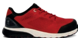
7806 RED | 35 ▶ 48