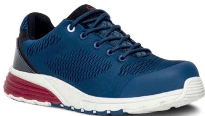
7802 BLUE | 35 ▶ 48