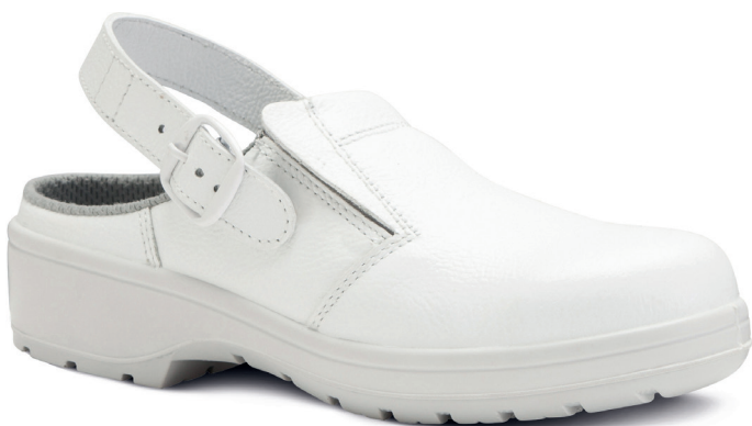
□ 8767 WHITE | 36 ▶ 42