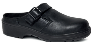
■ 8764 BLACK